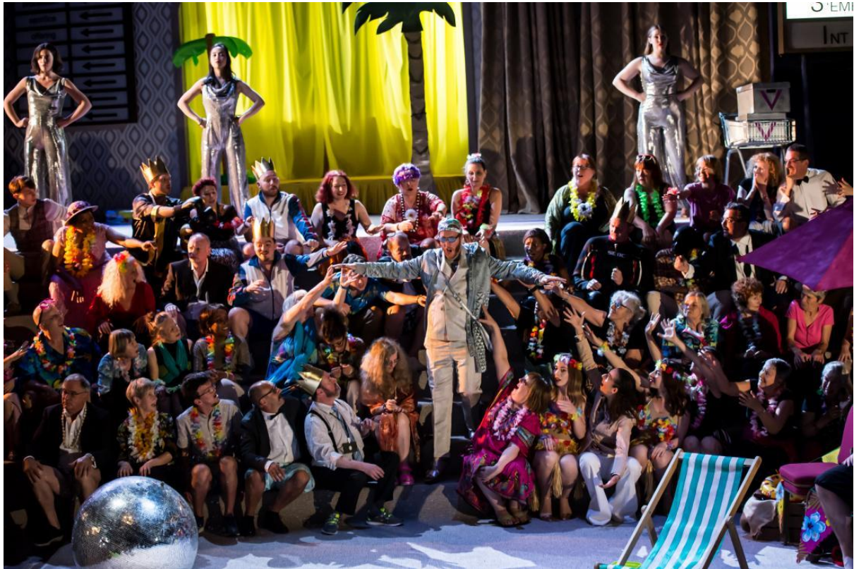
Photo: Blackheath Halls Community Opera's 2019 production Offenbach's La belle Hélène

musical theatre project in collaboration with Trinity Laban Musical Theatre, and Greenwich and Blackheath Halls Youth Choir's concert with the London Philharmonic Orchestra at the Royal Festival Hall all had to be cancelled due to Covid-19. A large number of other performances and hires also had to be cancelled or rescheduled at short notice in March, and we were heartened and appreciative of the understanding of both artists and audiences, many of whom donated the price of their tickets rather than receive a refund.