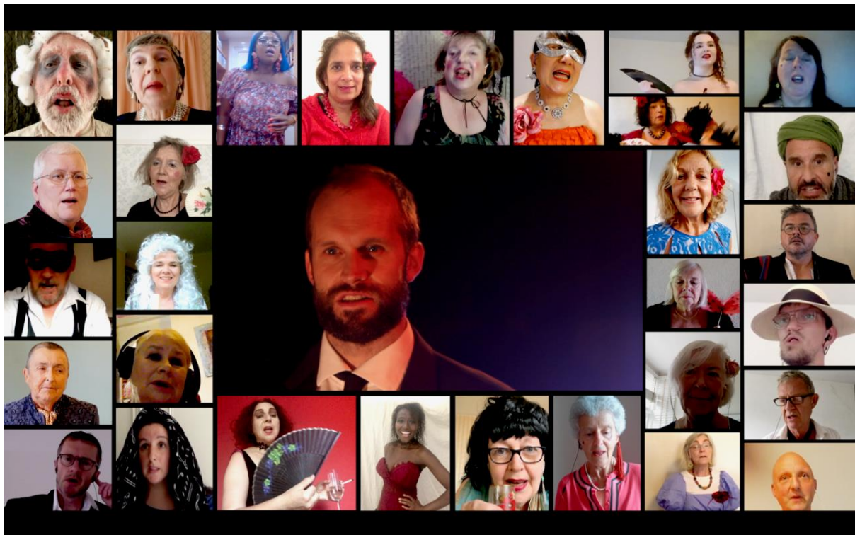
Photo: Still from 'A Journey Through The Rake's Progress', presented by Blackheath Halls Community Opera