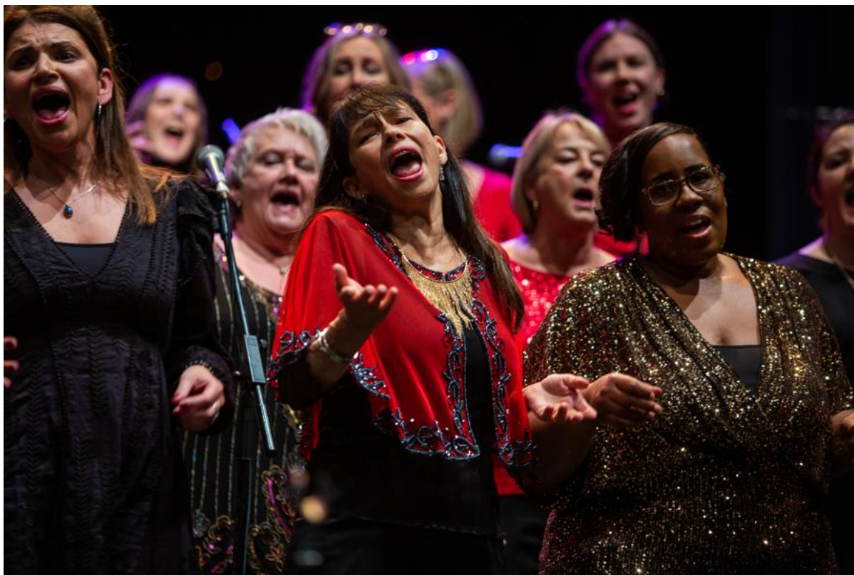
Photo: Blackheath Halls goes Gospel

Blackheath Halls runs a wide-ranging Community Engagement Programme for people of all ages and abilities, including workshops, taster sessions, tea dances and community performances. Current projects include Blackheath Halls Orchestra, Blackheath Halls Chorus, Blackheath Goes Gospel and the celebrated Blackheath Halls Opera, which brings together a professional creative team with community participants to produce a fully staged annual opera. Blackheath Halls also works closely with the Greenwich and Lewisham Music Hubs and manages the Royal Greenwich and Blackheath Halls Youth Choir, made up of outstanding young singers of all backgrounds, nominated by their schools.