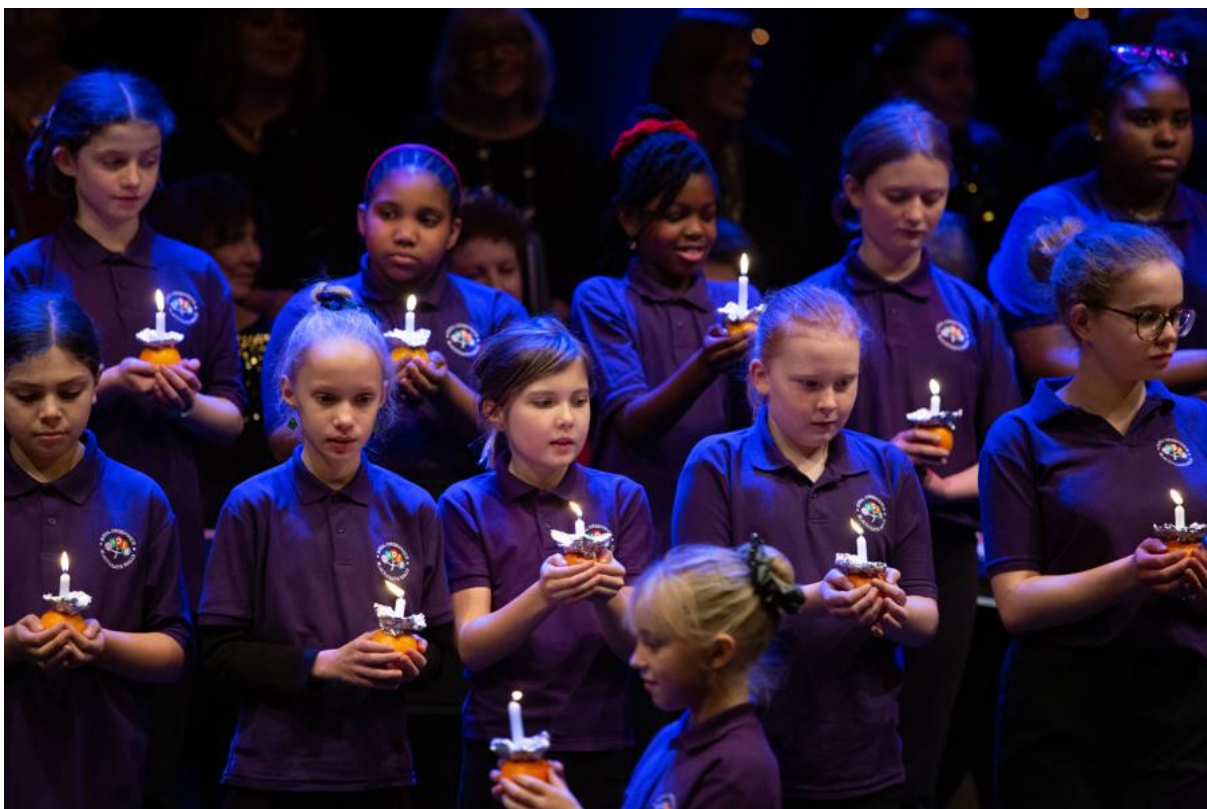
Photo: Christmas Concert at Blackheath Halls

Our refurbished facilities have offered a revitalised and popular venue for hirers. During the year these have included rehearsals or recordings with English National Opera, Orchestra of the Age of Enlightenment, Philharmonia, London Philharmonic Orchestra, Royal Philharmonic Orchestra, English Chamber Orchestra, Aurora Orchestra and Royal Opera House. Other hirings have included London International Early Music Festival, Celebrate Royal Greenwich (Greenwich Music Hub schools performances), the Age Exchange Christmas Fair and Turning of the Year (Lewisham Music) plus private hires including wakes and wedding receptions.