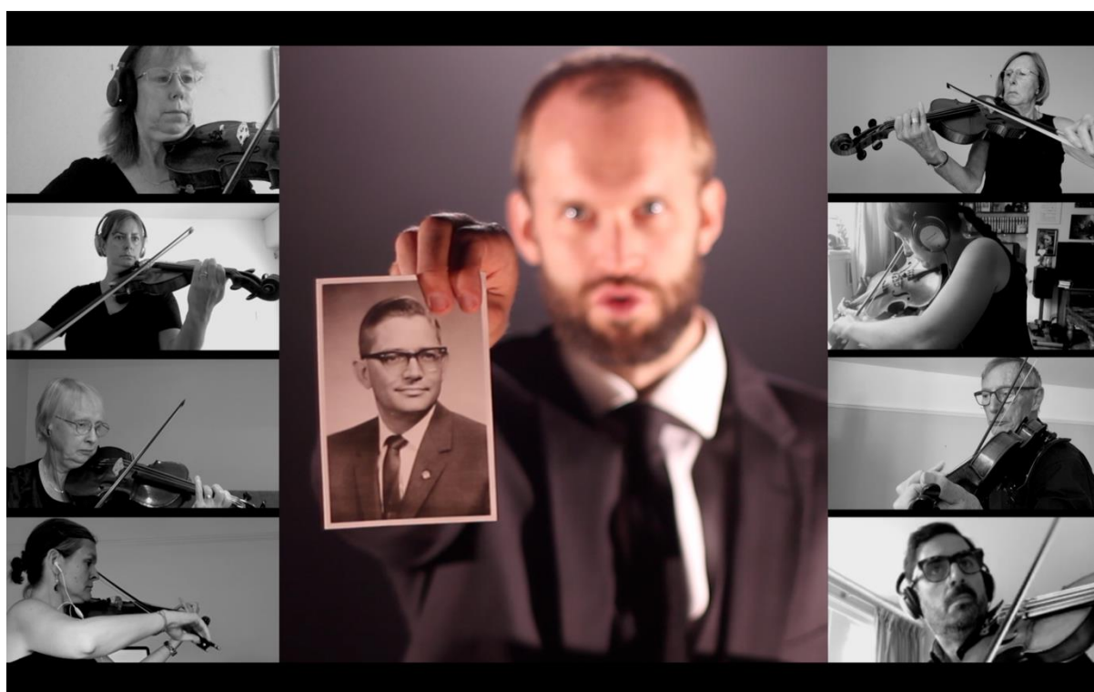
Still from 'A Journey Through the Rake's Progress' Blackheath Halls Opera on film, August 2020