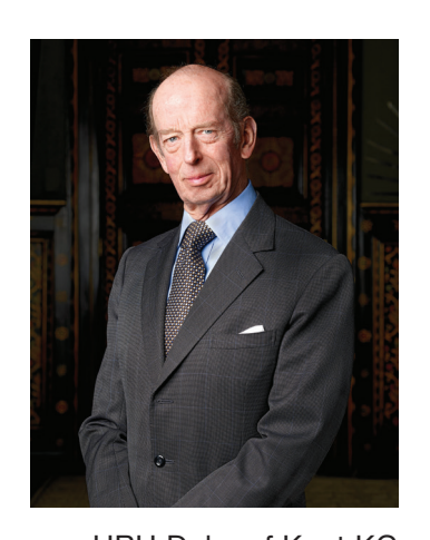
HRH Duke of Kent KG Patron of Trinity Laban Conservatoire of Music and Dance