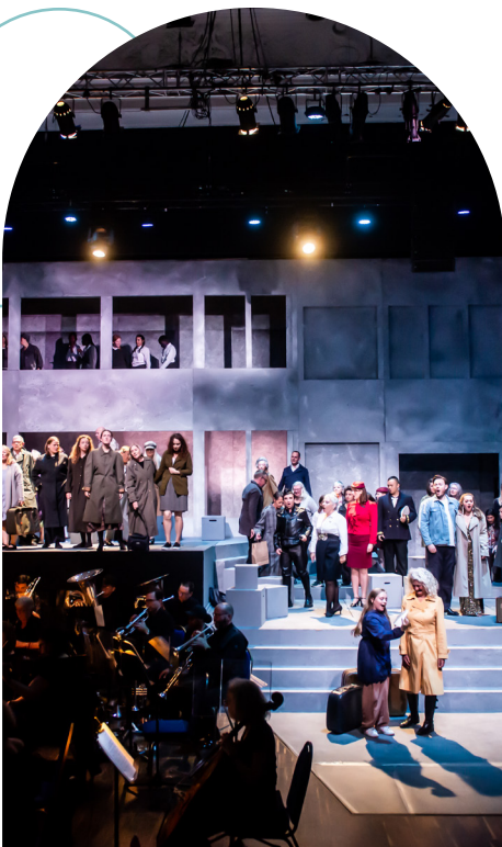
Great Hall: Blackheath Halls Opera Candide 2022