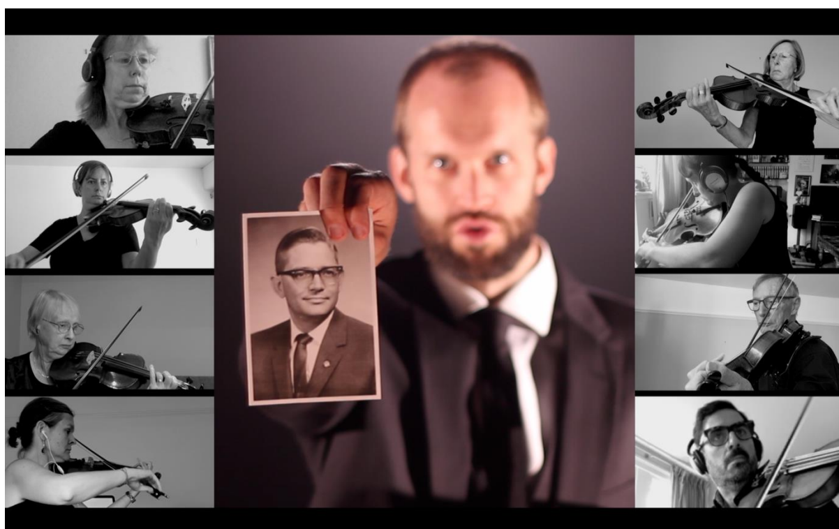
Still from 'A Journey Through the Rake's Progress' Blackheath Halls Opera on film, August 2020